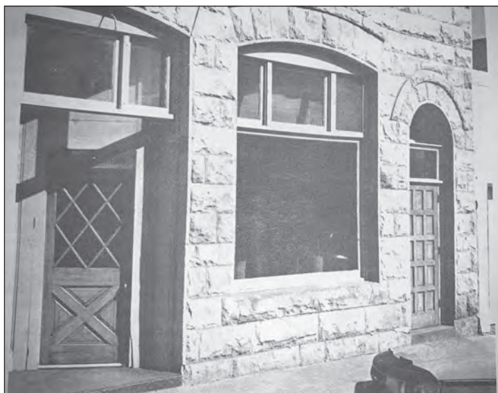
The first office of SLVREC, located across the street from the Monte Vista Elks Club encompassed 600 square feet of space.