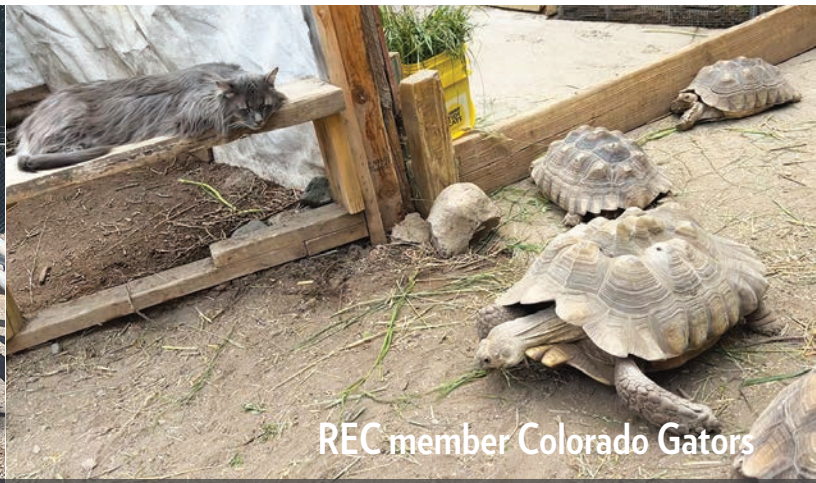
REC member Colorado Gators