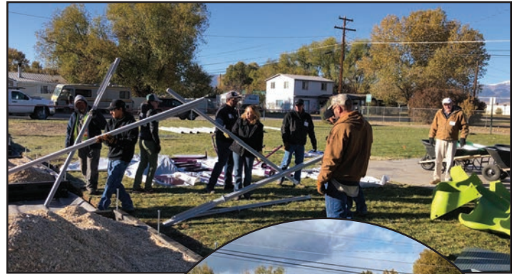
Above and at right: REC employees help out at Sanchez Park.