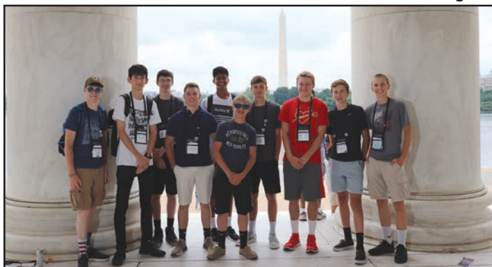
Teens from rural parts of America come together for the annual Washington D.C. Youth Tour.