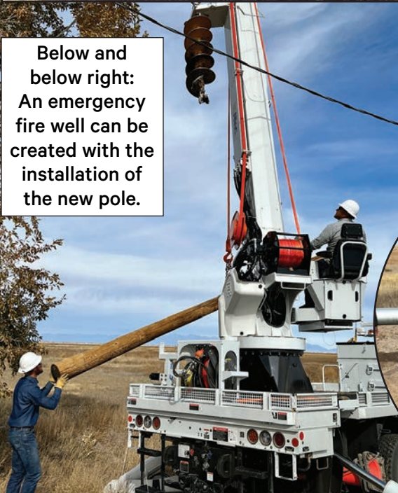
Below and below right: An emergency fire well can be created with the installation of the new pole.