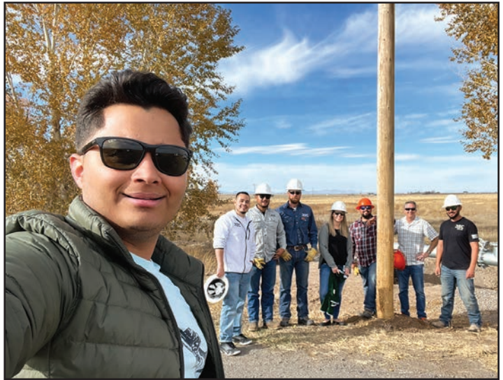
Above: A pole was installed by SLVREC employees on the wildlife refuge as part of a new emergency fire well. Below: Employees volunteered at Sanchez Park in October.

people, supported local food banks, assisted families in need to keep the lights on and much, much more.