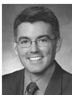
Rep. Cory Gardner (R-Dist. 63) PO Box 86 Yuma, CO 80759 303-866-2906 (Capitol) 970-848-2232 (Home) cory@corygardner.net